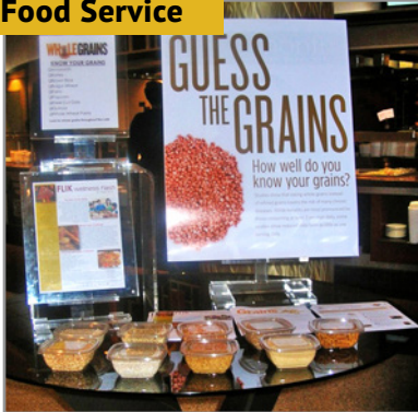
Guess the Grains Sampling Bar Compass NA cafeteria