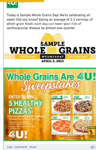
Facebook Sweepstakes Better4U Foods