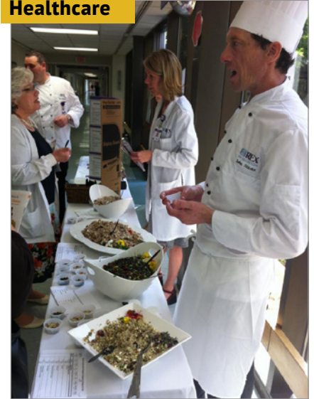
Chef Demo and RD Talk Rex Healthcare