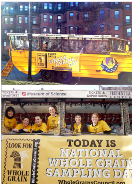
Duck Boat Sample Giveaway Whole Grains Council