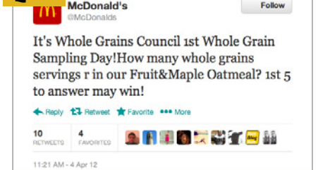
Twitter Giveaway McDonald's