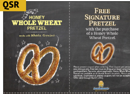
Buy One, Get One Free offer Auntie Anne's