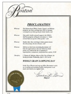
Mayoral Proclamation City of Boston