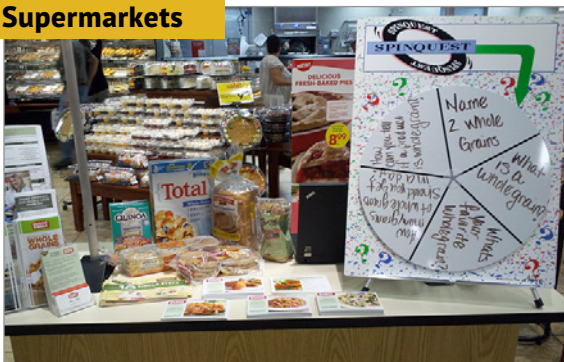
Quiz Game, Whole Grain Prizes Giant Eagle Supermarkets